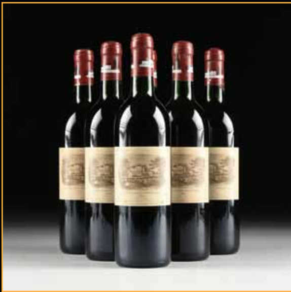
191 A GROUP OF SIX BOTTLES OF 1990 CHATEAU LAFITE PAUILLAC WINE. Estimate: $1,000.00 - $2,000.00