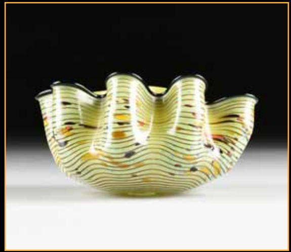
234 DALE CHIHULY (American b. 1941) A CASED STUDIO ART GLASS "MACCHIA" BOWL, SEATTLE, WASHINGTON, 1983. Width: 7 3/4" Estimate: $2,000.00 - $4,000.00