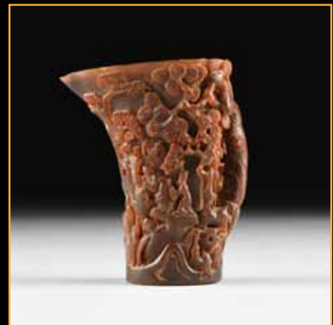
168 A CHINESE EROTIC CARVED WATER BUFFALO HORN CUP. Height: 4 3/8" Width: 3 3/4" Depth: 1 3/4" Estimate: $800.00 - $1,000.00