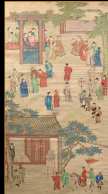
246 A MING DYNASTY STYLE SCROLL PAINTING OF A GARDEN, CHINESE, POSSIBLY 19TH CENTURY. 74" x 39" Estimate: $1,000.00 - $2,000.00