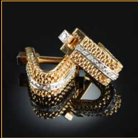
232 A PAIR OF FRENCH 18K YELLOW GOLD HALLMARKED AND DIAMOND STIRRUP CUFFLINKS. Estimate: $2,000.00 - $4,000.00