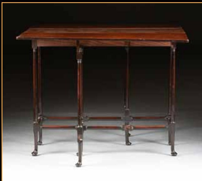
123 A GEORGE III MAHOGANY SPIDER GATE LEG TABLE, ENGLISH, LATE 18TH CENTURY. Height: 28" Estimate: $400.00 - $800.00