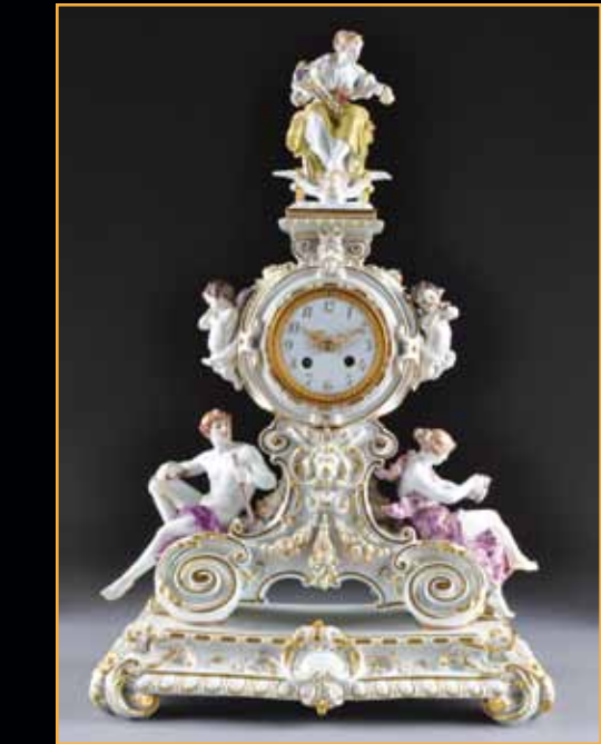
136 A MEISSEN RENAISSANCE REVIVAL PARCEL GILT WHITE GROUND MANTLE CLOCK, THE MOVEMENT BY LENZKIRCH, CIRCA 1880. Height: 25" Width: 16" Depth: 9 1/4" Estimate: $8,000.00 - $12,000.00