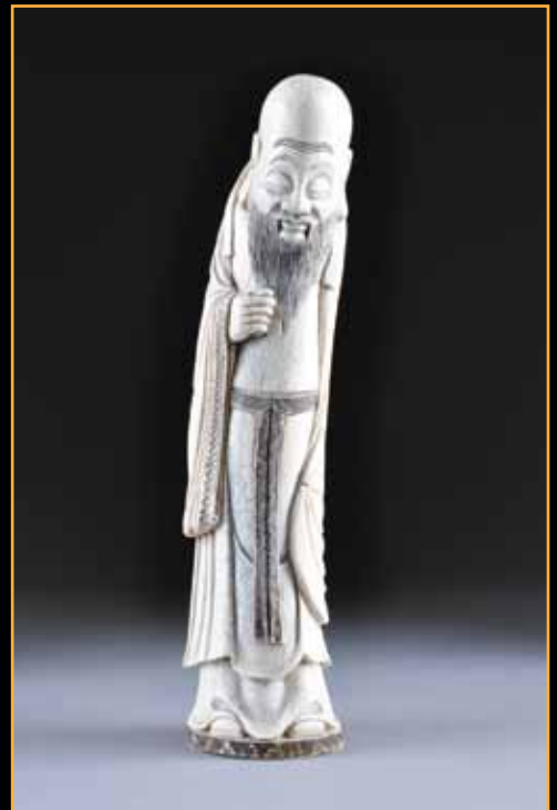
17 A FINE ANTIQUE CHINESE CARVED IVORY FIGURE OF AN ELDER. Height: 18" Estimate: $2,000.00 - $4,000.00