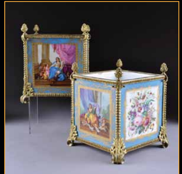
96 A PAIR OF SÈVRES STYLE GILT BRONZE MOUNTED TURQUOISE GROUND JARDINIÈRES (CAISSES CARRÉES), THIRD QUARTER 19TH CENTURY. Height: 11” Width: 9” Estimate: $3,000.00 - $5,000.00