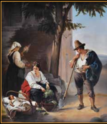
345 FRIEDA MARTIN (Italian School Late 19th Century) A PAINTING, "Italian Family," oil on canvas, signed and dated 1873. L/R. 26 1/8" x 23". Framed. Estimate: $4,000.00 - $6,000.00