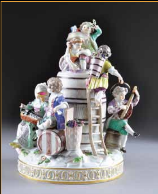
159 A LARGE MEISSEN PORCELAIN FIGURAL GROUP ORIGINALLY MODELED BY SCHOENAU. Height: 12" Estimate: $4,000.00 - $5,000.00