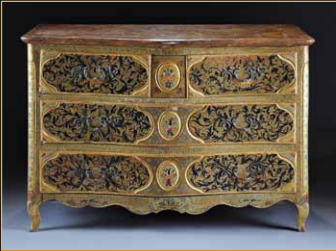
157 A FRENCH PROVINCIAL PARCEL GILT AND PAINTED COMMODE, MID 18TH CENTURY. Height: 34 3/4" Width: 51 1/8" Depth: 25 3/4" Estimate: $7,000.00 - $9,000.00