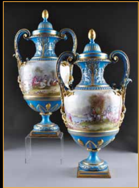
374 A LARGE PAIR OF SÈVRES STYLE PARCEL GILT TURQUOISE GROUND VASES WITH COVERS, SIGNED A. MERIN, LATE 19TH CENTURY. Height: 28 3/4" Estimate: $25,000.00 - $30,000.00