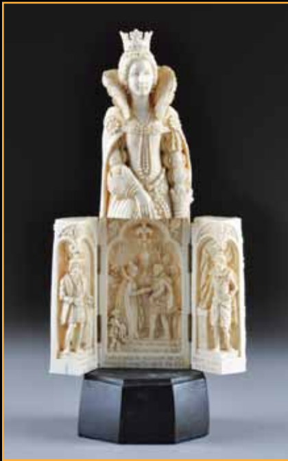
314 A FRENCH CARVED IVORY FIGURE OF MARIE DE MEDICI, POSSIBLY DIEPPE, LATE 19TH CENTURY. Height: 11” Estimate: $2,000.00 - $4,000.00