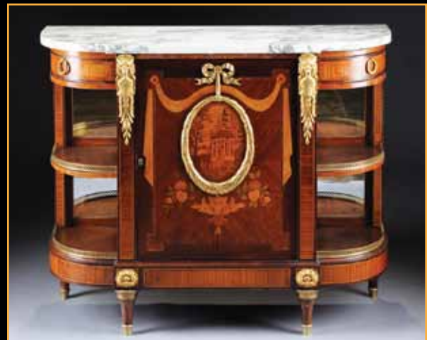
117 A LOUIS XVI STYLE GILT BRONZE MOUNTED MAHOGANY AND MARQUETRY INLAID COMMODE À L'ANGLAISE, MOUNTS INCISED M J NIELSEN, LATE 19TH/EARLY 20TH CENTURY. Height: 40 1/8" Width: 54" Depth: 19 1/8" Estimate: $6,000.00 - $8,000.00