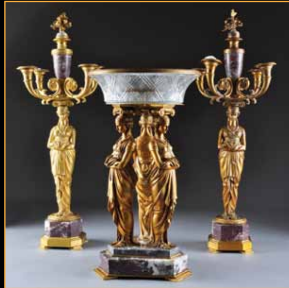
147 A LOUIS XVI STYLE GILT BRONZE AND FLEUR DE PÊCHER MARBLE GARNITURE. Height: 30 1/4". Estimate: $6,000.00 - $8,000.00