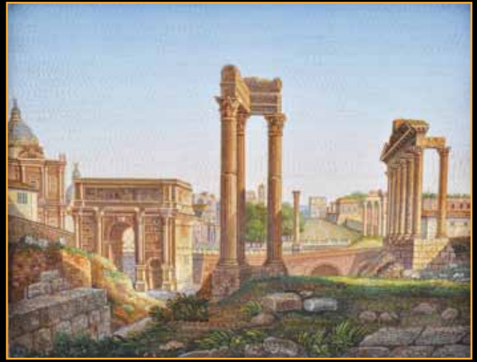
329 AN ITALIAN MICROMOSAIC PANEL DEPICTING RUINS IN THE ROMAN FORUM, LATE 19TH CENTURY. 11" x 13 1/2" Estimate: $15,000.00 - $25,000.00