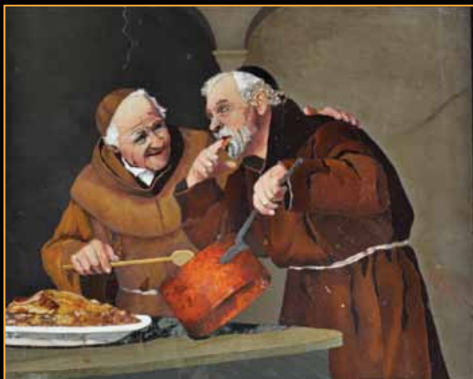
289 AN ITALIAN PIETRA DURA PLAQUE, SIGNED G. ZACCAGNINI, LATE 19TH CENTURY, depicting two jovial elderly Franciscan monks tasting freshly cooked meal from a copper pot. Height: 9 3/8" Width: 11 1/8" Estimate: $4,000.00 - $6,000.00