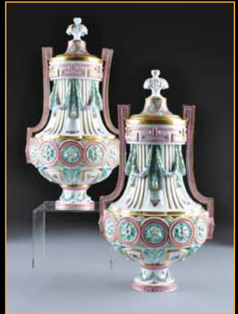
379 A PAIR OF MEISSEN PINK GROUND DRUM SHAPED VASES AND COVERS. Height: 19 3/4" Estimate: $5,000.00 - $7,000.00