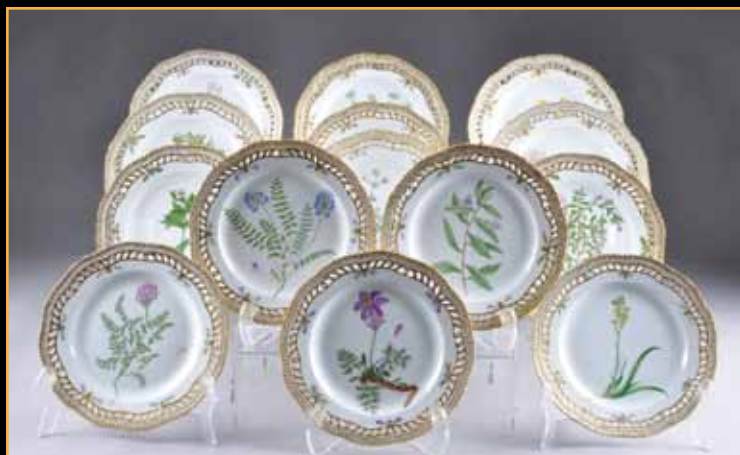
364 A SERVICE OF FOURTEEN ROYAL COPENHAGEN FLORA DANICA DESSERT PLATES. Mint condition. Diameter: 9". Estimate: $15,000.00 - $20,000.00