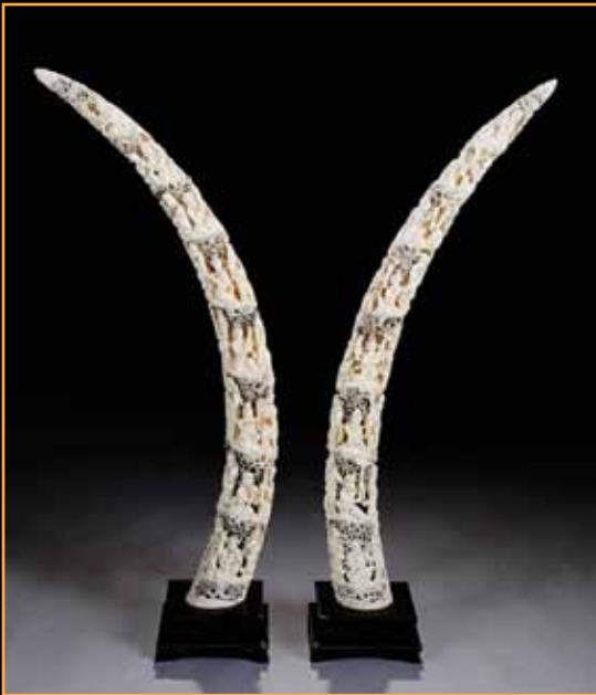
102 A FINE PAIR OF CHINESE CARVED IVORY TUSKS, each pierced carved in relief with deities and attendants within a mountainous wooded landscape. On carved and hardwood stands. Length: 45" Estimate: $10,000.00 - $20,000.00