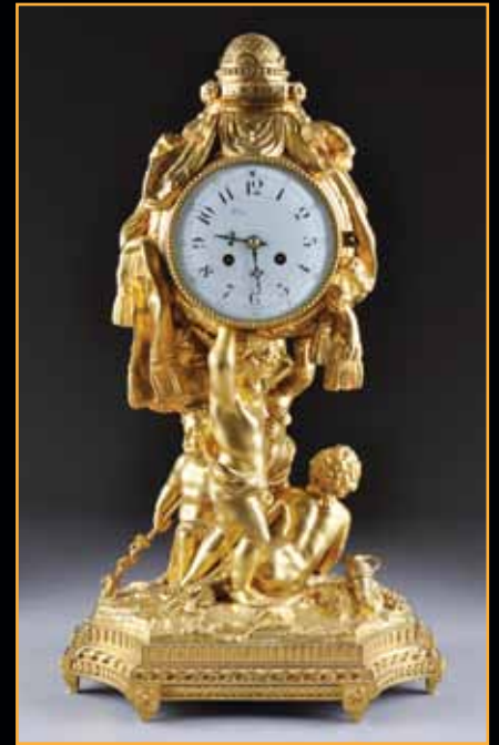
137 A LOUIS XVI STYLE GILT BRONZE FIGURAL MANTLE CLOCK, THE MOVEMENT BY LEROLLE FRÈRES, PARIS, SECOND HALF 19TH CENTURY. Height: 22 5/8” Width: 12 3/4” Depth: 19” Estimate: $4,000.00 - $6,000.00