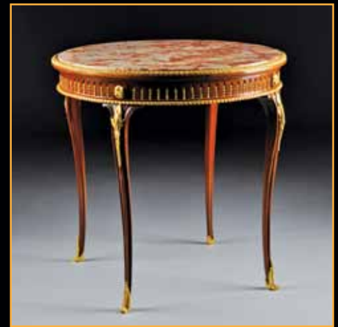
297 A FINE LOUIS XV/XVI STYLE GILT BRONZE MOUNTED MAHOGANY AND INCARNAT TURQUIN MARBLE GUÉRIDON BY FRANÇOIS LINKE, LATE 19TH/EARLY 20TH CENTURY. Stamped on underside F. Linke...Paris. Height: 29 3/4" Diameter: 29 5/8" Estimate: $10,000.00 - $15,000.00

Simpson Galleries will host an evening reception, Thursday June 2, 2011 from 6-8 p.m. Music and refreshments will be available. Please call to RSVP for this event.