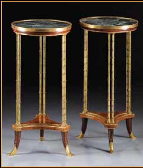
144 A PAIR OF LOUIS XVI STYLE GILT BRONZE, BURL AMBOYNA, AND MARBLE TOP GUÉRIDONS, AFTER A MODEL BY ADAM WEISWEILER, LATE 19TH CENTURY. Height: 29 3/8" Diameter: 14 3/4" Estimate: $10,000.00 - $15,000.00

Simpson Galleries will host an evening reception, Thursday June 2, 2011 from 6-8 p.m. Music and refreshments will be available. Please call to RSVP for this event.