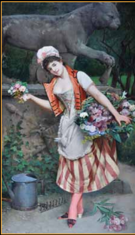
210 ARTURO ORSELLI (European 19th Century) A PAINTING, "The Flower Vendor," oil on canvas, signed C/L. 42" x 73". Framed. Estimate: $8,000.00 - $12,000.00