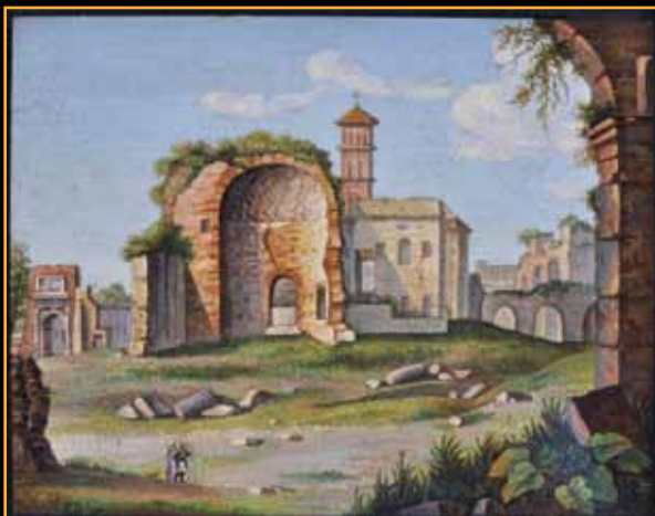
262 AN ITALIAN MICROMOSAIC OF "TERME DI CARACALLA," 19TH CENTURY, in carved giltwood frame. 6 1/2" x 8" Estimate: $8,000.00 - $12,000.00